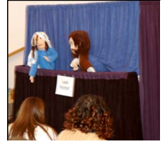
Children's Corner: D.O.G. Puppet Ministry