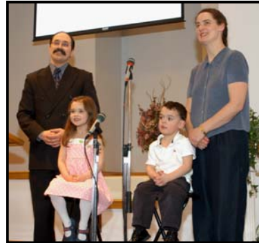
Worship in Song—the Dovich family